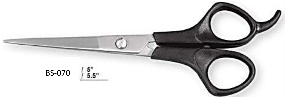
BS-070 / 5" / 5.5"