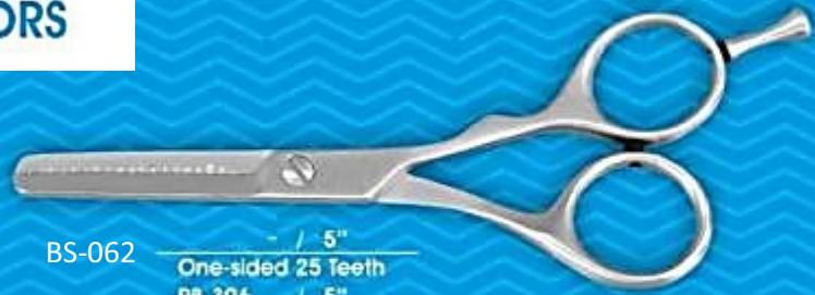
BS-062 - / 5" One-sided 25 Teeth RB-306 - / 5" Double-sided 25 Teeth - / 6" One-sided 30 Teeth - / 6" Double-sided 30 Teeth