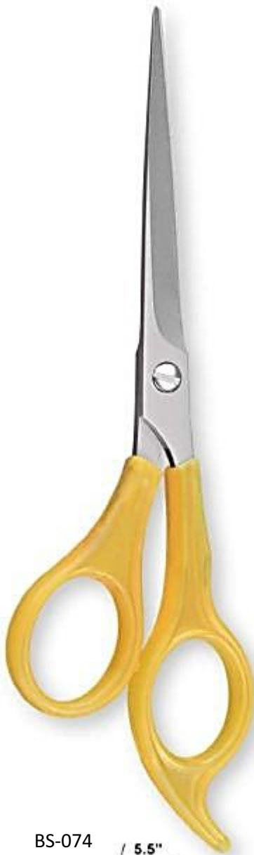
BS-074 / 5.5"