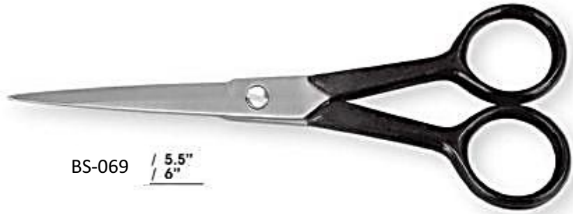
BS-069 / 5.5" / 6"