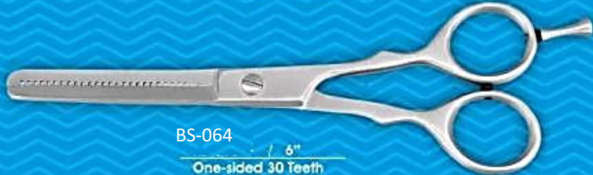
BS-064 - / 6" One-sided 30 Teeth - / 6" Double-sided 30 Teeth