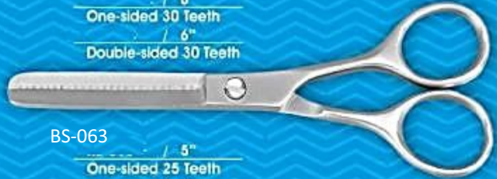
BS-063 - / 5" One-sided 25 Teeth - / 5" Double-sided 25 Teeth