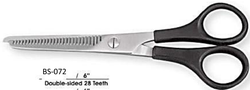
BS-072 / 6" Double-sided 28 Teeth / 6" Single-sided 28 Teeth