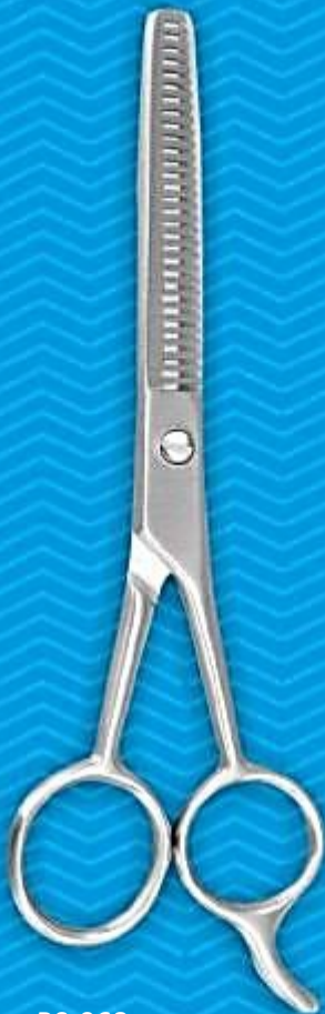
BS-068 - / 5" One-sided 25 Teeth - / 5" Double-sided 25 Teeth - / 6" One-sided 30 Teeth - / 6" Double-sided 30 Teeth