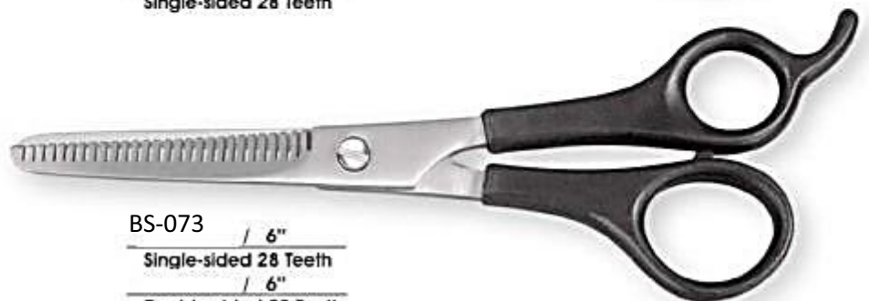
BS-073 / 6" Single-sided 28 Teeth / 6" Double-sided 28 Teeth