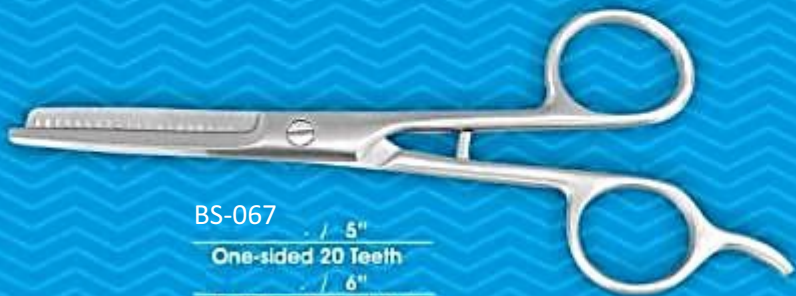
BS-067 - / 5" One-sided 20 Teeth - / 6" Double-sided 24 Teeth