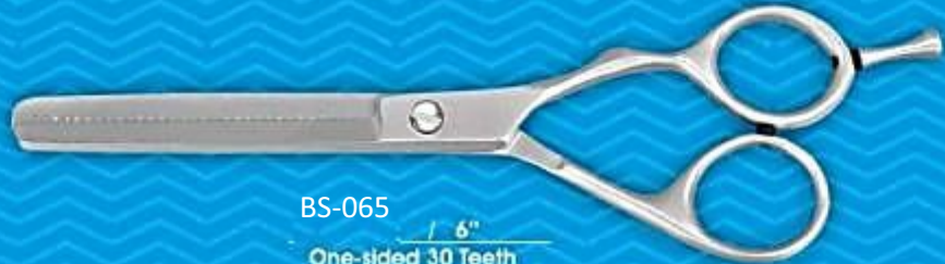
BS-065 - / 6" One-sided 30 Teeth - / 6" Double-sided 30 Teeth