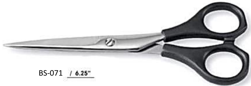
BS-071 / 6.25"