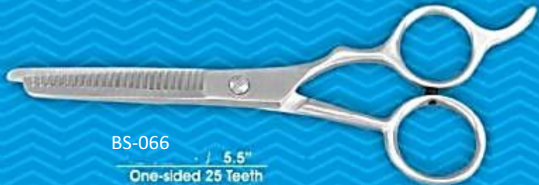
BS-066 - / 5.5" One-sided 25 Teeth